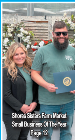
Shores Sisters Farm Market Small Business Of The Year Page 12