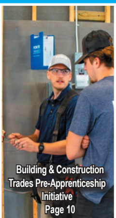
Building & Construction Trades Pre-Apprenticeship Initiative Page 10