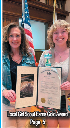
Local Girl Scout Earns Gold Award Page 5