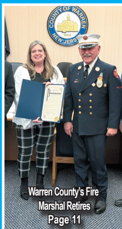
Warren County's Fire Marshal Retires Page 11