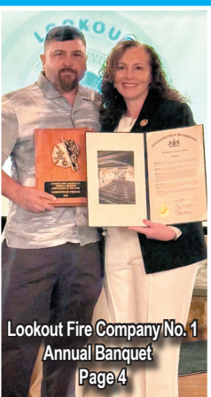
Lookout Fire Company/No. 1 Annual Banquet Page 4