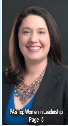
PA's Top Women in Leadership Page 5