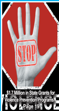
$1.7 Million in State Grants for Violence Prevention Programs Page 19