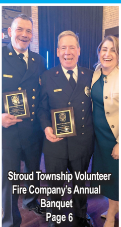
Stroud Township Volunteer Fire Company's Annual Banquet Page 6