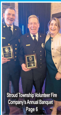
Stroud Township Volunteer Fire Company's Annual Banquet Page 6