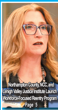
Northampton County, NCC, and Lehigh Valley Justice Institute Launch Workforce-Focused Reentry Program Page 5

For more info - Phone: (570) 517-6600 https://www.psfcr.org/our-services .