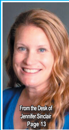
From the Desk of Jennifer Sinclair Page 13