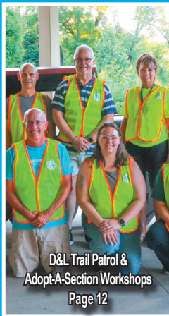
D&L Trail Patrol & Adopt-A-Section Workshops Page 12