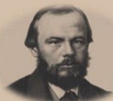
Fyodor Dostoevsky The famous Russian writer