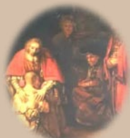
The Parable of the Prodigal Son by Rembrandt Luke 15