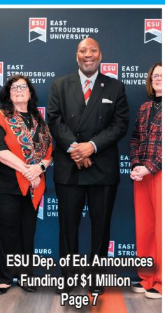
ESU Dep. of Ed. Announces Funding of $1 Million Page 7