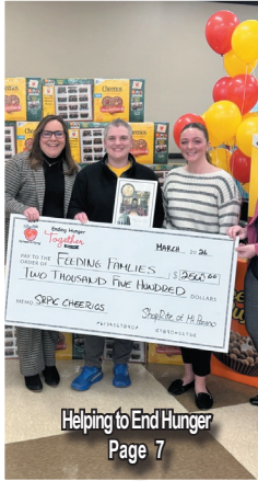
Helping to End Hunger Page 7