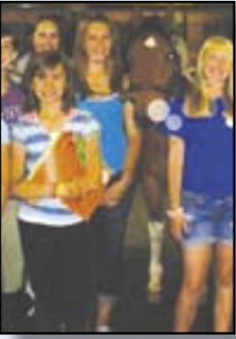
Mane and Braiding page 3