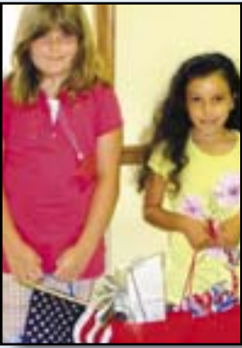
Patriotic Contest Winners page 6