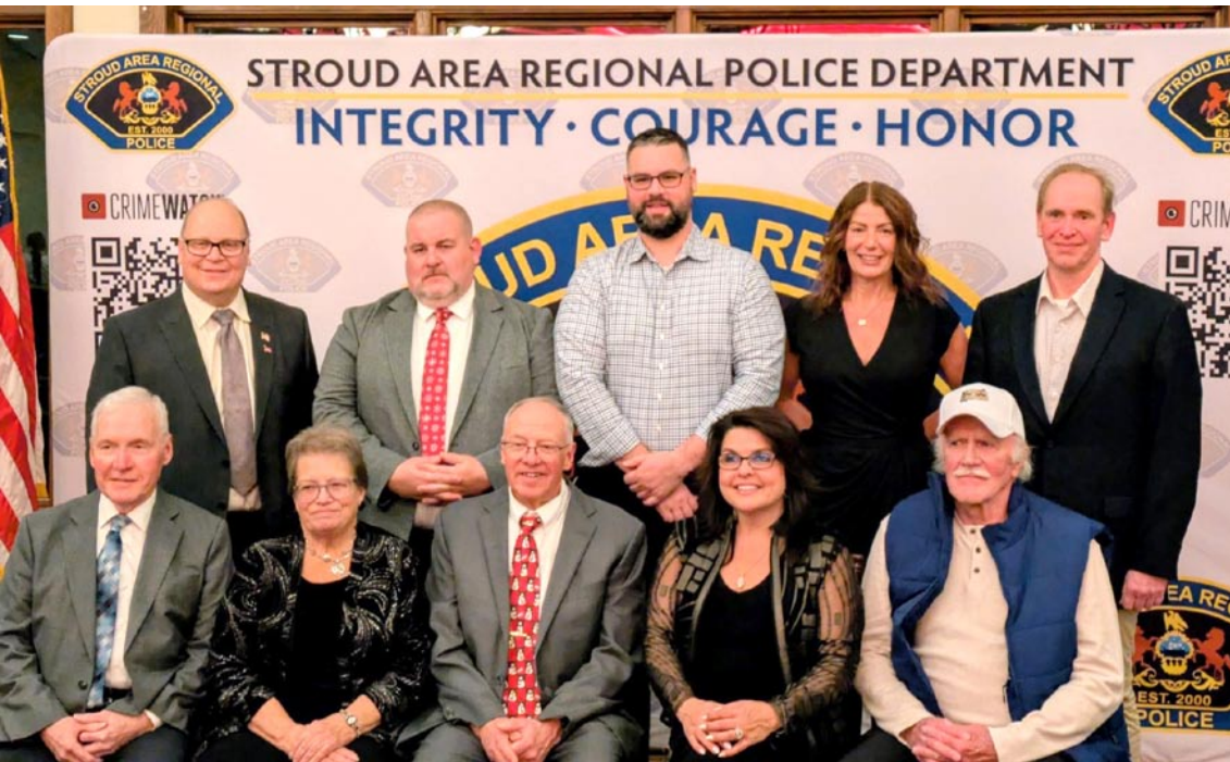
Stroud Area Regional Police Department as they celebrated 25 years