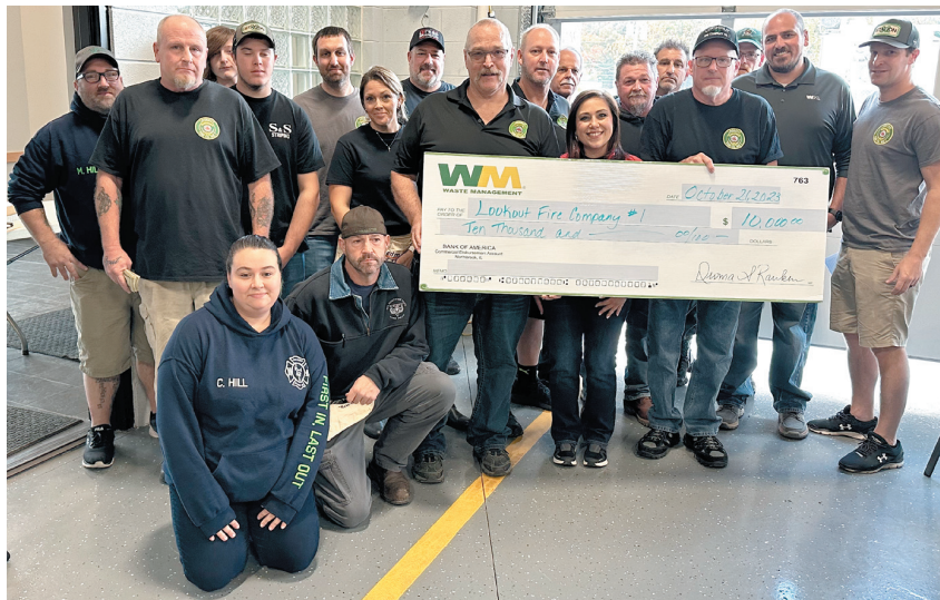
Lookout Fire Co. accepts $10,000 donation from Waste Management