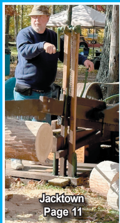
Jacktown Page 11