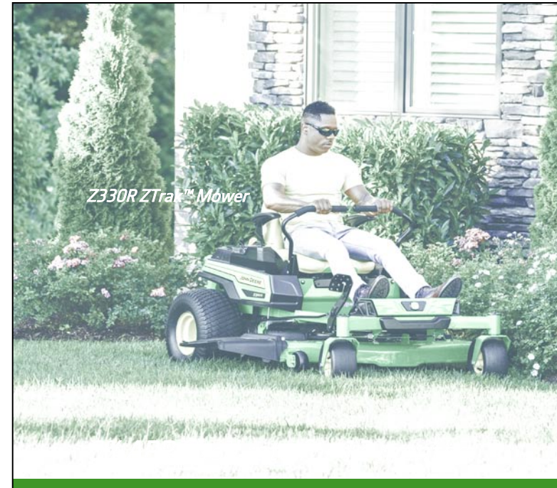
Z330R ZTrak™ Mower