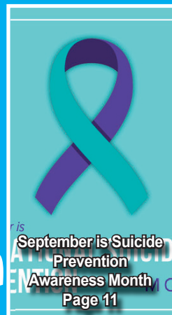
September is Suicide Prevention Awareness Month Page 11