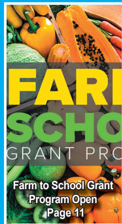
Farm to School Grant Program Open Page 11