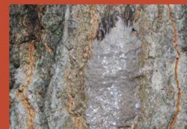
Egg mass (fresh) can be found October–December