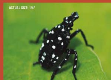
Actual size: 1/4" Nymph (early stage) can be found late April–July