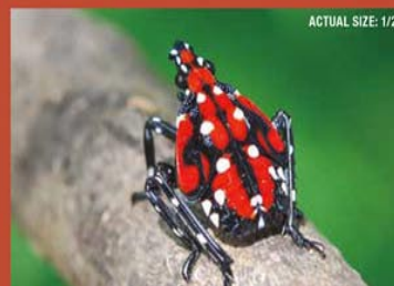
Actual size: 1/2" Nymph (late stage) can be found July–September