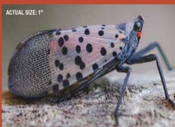
Actual size: 1" Adult (with wings closed) can be found July–December