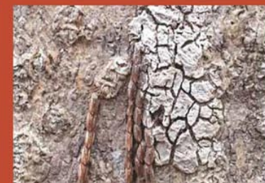
Egg mass (older) can be found January–June