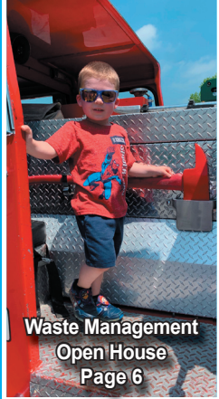
Waste Management Open House Page 6