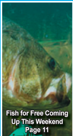
Fish for Free Coming Up This Weekend Page 11