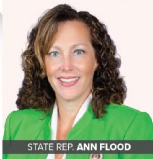
STATE REP. ANN FLOOD