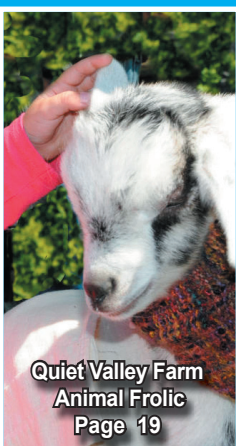
Quiet Valley Farm Animal Frolic Page 19

Preparing Students Ready for the Workforce Page 8