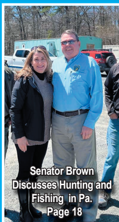
Senator Brown Discusses Hunting and Fishing in Pa. Page 18