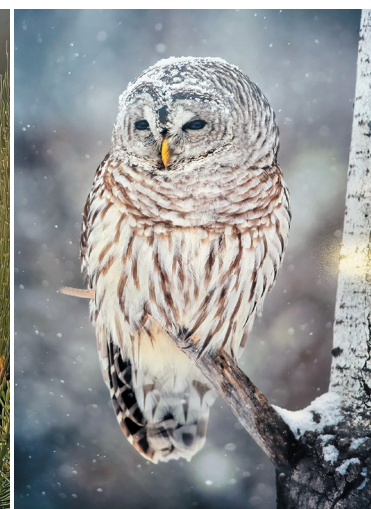
This silent auction metal print received the most bids