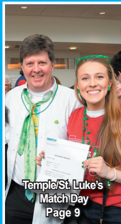
Temple/St. Luke's Match Day Page 9