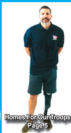
Homes For Our Troops Page 5