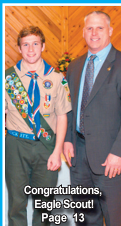
Congratulations, Eagle Scout! Page 13