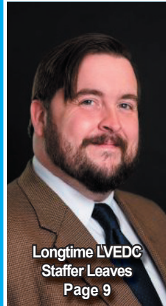
Longtime LVEDC Staffer Leaves Page 9