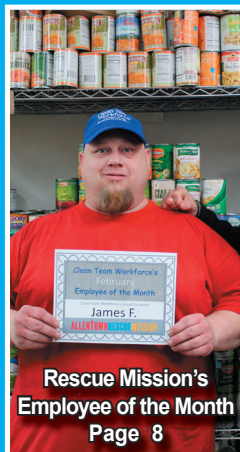
Rescue Mission's Employee of the Month Page 8