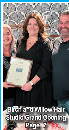
Birch and Willow Hair Studio Grand Opening Page 7