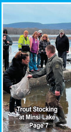
Trout Stocking at Minsi Lake Page 7