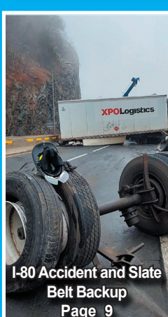
I-80 Accident and Slate Belt Backup Page 9