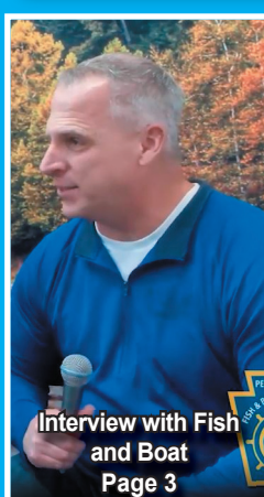
Interview with Fish and Boat Page 3