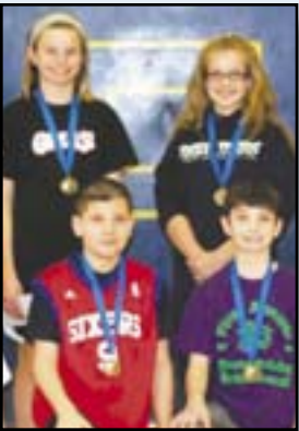
Knights of Columbus News page 2