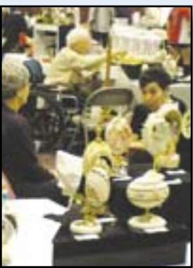
Egg Show Preparation page 4