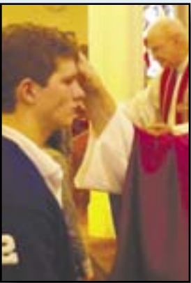
Ash Wednesday at Pius X page 3