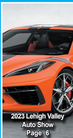
2023 Lehigh Valley Auto Show Page 6