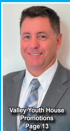
Valley Youth House Promotions Page 13