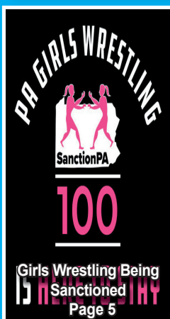
Girls Wrestling Being Sanctioned Page 5