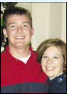
Lieberman and Thatcher page 4