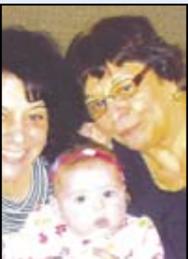
4 Generations page 11