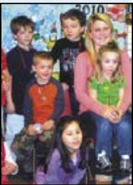
Moose Youth Awareness Program page 3