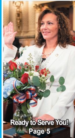
Ready to Serve You! Page 5