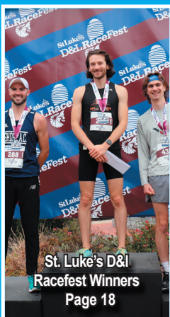
St. Luke's D&I Racefest Winners Page 18