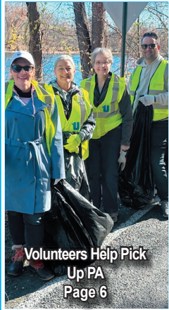
Volunteers Help Pick Up PA Page 6