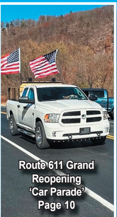
Route 611 Grand Reopening 'Car Parade' Page 10